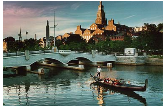
Revitalized Providence waterfront

A credit is available against the personal income tax for 10% of each $1,000 of the purchase price of qualifying artwork to a maximum purchase price of $10,000. The credit is available to taxpayers presenting written certification from the Board of Curators (see RIGL 42-97). Unused credits cannot be carried forward.