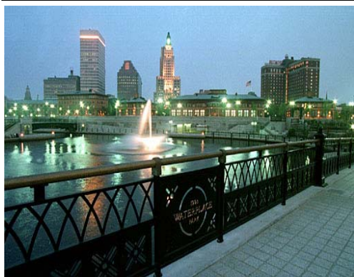
Waterplace Park, Providence.