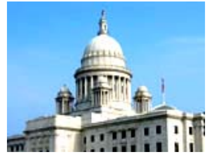
Rhode Island State House

Sole proprietors are taxed on business income on their personal income tax return. Rhode Island recognizes both Limited Liability Corporations and S-Corporations.