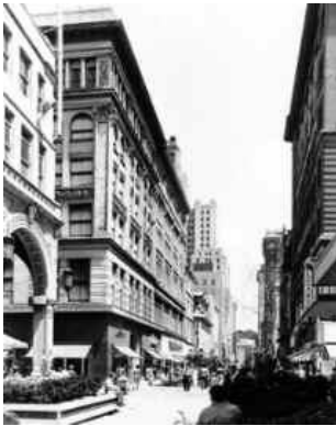
Historic downtown Providence

Rhode Island's state tax credit for rehabilitation of historic income-producing buildings is one of the most innovative in the nation, and has generated over $485 million in new private investment. Buildings that are listed on the National Register of Historic Places or which are located within a National Register Historic District (and contribute to the district's significance, or if it is part of a local historic district) are eligible.