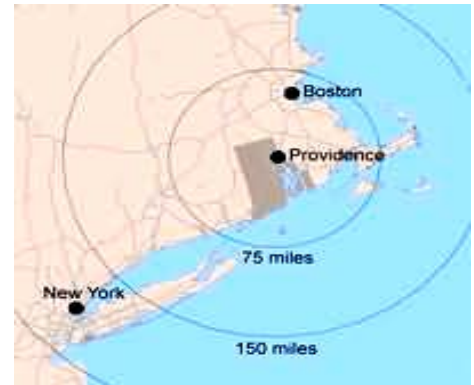
Rhode Island’s strategic location

Rhode Island’s innovation economy draws additional strength from its’ proximity to the largest concentration of higher education facilities in the United States. With high-caliber institutions like the Rhode Island School of Design and Brown University located within the State’s borders, high-tech brainpower is driving innovation in areas such as health and life sciences, industrial design, next generation defense research, and marine and environmental technology.