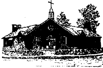
TOWN BUILDING HARRISVILLE, R.I.