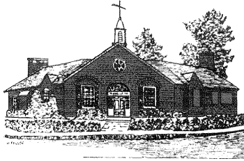
TOWN BUILDING HARRISVILLE, R.I.

Telephone: (401) 568-4300 ext. 114 FAX: (401) 568-0490 E-mail: townclerk@burrillville.org RI Relay 1-800-745-5555 (TTY)