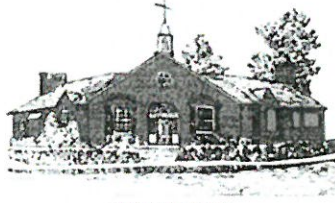
TOWN BUILDING HARRISVILLE, R.I.