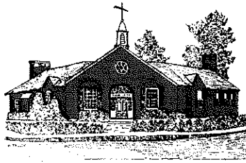
TOWN BUILDING HARRISVILLE, R.I.

Telephone: (401) 568-4300 ext. 124 FAX: (401) 568-0490 E-mail: townclerk@burrillville.org RI Relay 1-800-745-5555 (TTY)