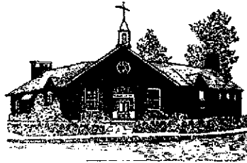
TOWN BUILDING HARRISVILLE, R.I.

Telephone: (401) 568-4300 ext. 124 FAX: (401) 568-0490 E-mail: townclerk@burrillville.org RI Relay 1-800-745-5555 (TTY)