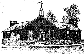
TOWN BUILDING HARRISVILLE, R.I.

Telephone: (401) 568-4300 ext. 124 FAX: (401) 568-0490 E-mail: townclerk@burrillville.org RI Relay 1-800-745-5555 (TTY)