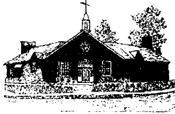
TOWN BUILDING HARRISVILLE, R.I.

Telephone: (401) 568-4300 ext. 114 FAX: (401) 568-0490 E-mail: townclerk@burrillville.org RI Relay 1-800-745-5555 (TTY)