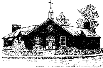
TOWN BUILDING HARRISVILLE, R.I.

Telephone: (401) 568-4300 ext. 114 FAX: (401) 568-0490 E-mail: townclerk@burrillville.org RI Relay 1-800-745-5555 (TTY)