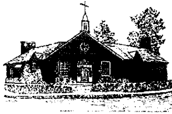
TOWN BUILDING HARRISVILLE, R.I.

Telephone: (401) 568-4300 ext. 114 FAX: (401) 568-0490 E-mail: townclerk@burrillville.org RI Relay 1-800-745-5555 (TTY)