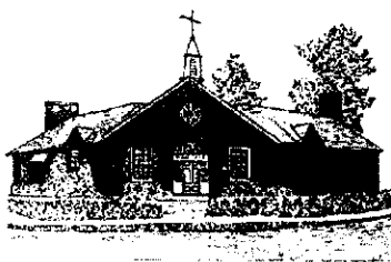
TOWN BUILDING HARRISVILLE, R.I.

Telephone: (401) 568-4300 ext. 114 FAX: (401) 568-0490 E-mail: townclerk@burrillville.org RI Relay 1-800-745-5555 (TTY)