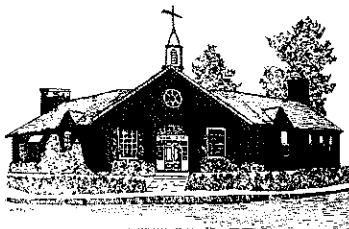
TOWN BUILDING HARRISVILLE, R.I.