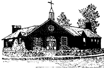
TOWN BUILDING HARRISVILLE, R.I.

Telephone: (401) 568-4300 ext. 124 FAX: (401) 568-0490 E-mail: townclerk@burrillville.org RI Relay 1-800-745-5555 (TTY)