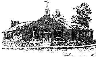
TOWN BUILDING HARRISVILLE, R.I.