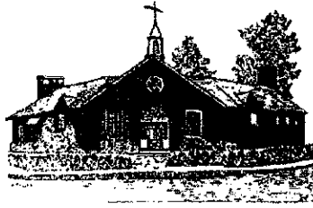
TOWN BUILDING HARRISVILLE, R.I.

Telephone: (401) 568-4300 ext. 124 FAX: (401) 568-0490 E-mail: townclerk@burrillville.org RI Relay 1-800-745-5555 (TTY)