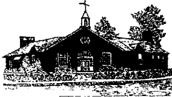
TOWN BUILDING HARRISVILLE, R.I.

Telephone: (401) 568-4300 ext. 124 FAX: (401) 568-0490 E-mail: townclerk@burrillville.org RI Relay 1-800-745-5555 (TTY)