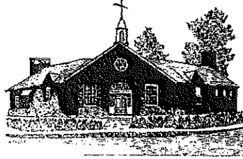
TOWN BUILDING HARRISVILLE, R.I.