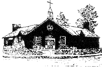
TOWN BUILDING HARRISVILLE, R.I.

Telephone: (401) 568-4300 ext. 114 FAX: (401) 568-0490 E-mail: townclerk@burrillville.org RI Relay 1-800-745-5555 (TTY)